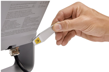
EXTERIOR WASH PRO MULTI-TOOL