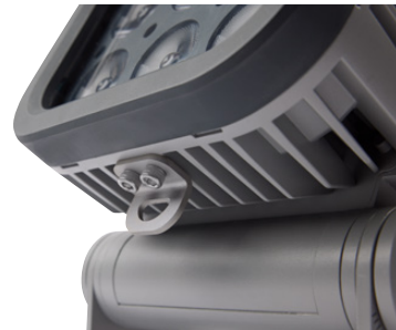
ATTACHMENT PLATE FOR SAFETY WIRE INSTALLED