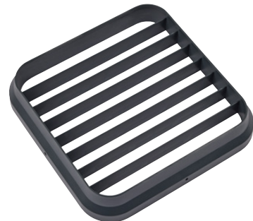
BAFFLE SNOOT PRO XL CTC