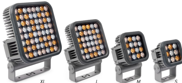
THE COMPLETE MARTIN EXTERIOR WASH PRO CTC LINE

HARMAN PROFESSIONAL INC. • 8500 BALBOA BOULEVARD • NORTHridge • CA 91329 • USA • +1 818 893 8411