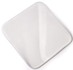
EXTERIOR WASH PRO MICRO LENS